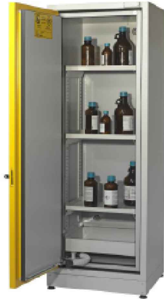
AC 600CM Armadio per infiammabili - 100 litri Safety storage cabinet - 100 liters L 68 - P 65 - H 198,5 Peso / Weight : 350 KG

Certificati / Certificates: EN 14470-1 / EN 16121